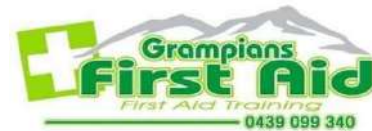
Grampians First Aid