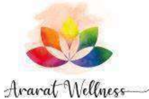
Ararat Wellness Centre