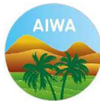
Ararat Islamic Welfare Association